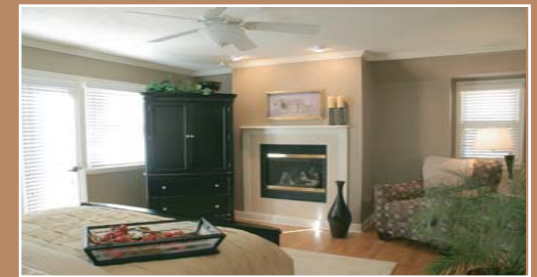
Rustically elegant touches with up-to-date amenities. Tempt even the most active guest to turn in early