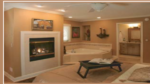
The decor speaks of artistic tastes and quality, from the hand-textured walls to the double-sized hottubs

Originally built as a private lodge, the sprawling lannon stone wings of the building, enhanced by the attached greenhouse, reflect the natural environment in an elegant living space that everyone visiting can enjoy. Two master suites located in the north wing are beautifully appointed with private fireplace and whirlpool bath. A common living area on the first floor of this wing provides a kitchenette and private exit that leads out to paved walkways and patios featuring a water garden stocked with Koi fish and water plants.